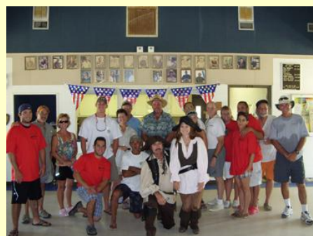
Aaarrgghh! – the Teams