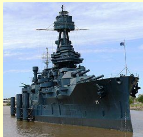
USS Texas at San Jacinto State Park, Oct-06

http://www.tpwd.state.tx.us/newsmedia/videos/state_park/gulf_coast/battleship_texas.phtml