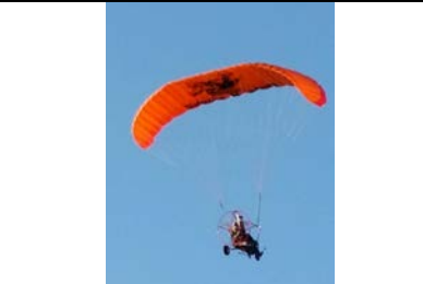
Entertainment from above