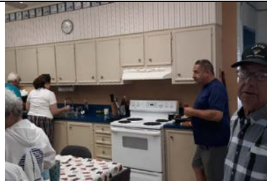
Hard working kitchen helpers