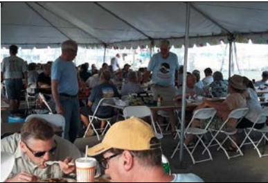
Enjoying a good meal