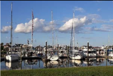
What a beautiful sight!