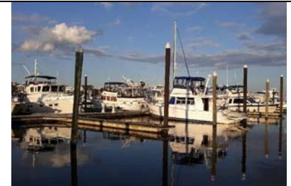
A calm in the marina