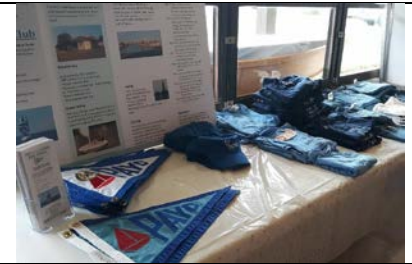
Goodies for sale