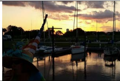
A beautiful sunset over the PAYC Marina