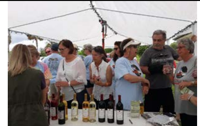
Wine tasting was a big hit!