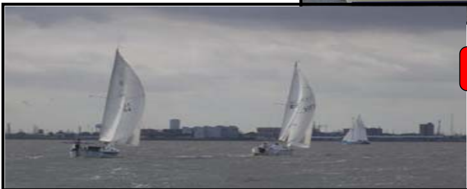
Closing in on the finish line!